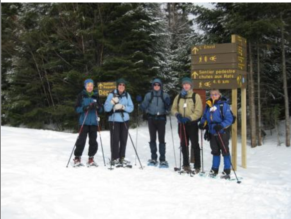
STS skiers at Mont-Tremblant 2010

Mont-Ste.-Anne Cross Country Ski Area, Quebec – affiliated with Mont-Ste.-Anne Resort . Mont-Sainte-Anne's trail system is vast and varied, mixing classic and a lot of skate-groomed trails. Mont-Ste.-Anne offers direct access from the alpine area onto 184 km of trails, making it one of the largest