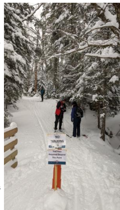
STS Skiers at Bretton Woods Nordic Center, NH 2020

Sun Peaks Nordic, British Columbia – affiliated with Sun Peaks Resort . Sun Peaks Nordic is a great, but little-known cross-country ski destination with 30-plus km of classic and skate-groomed trails. It features superb flowing terrain through meadows and forest, fantastic