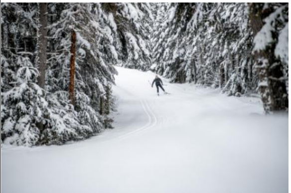
XC Skiing at Mt. Van Hovenberg in the ADK

Bretton Woods Nordic Center, New Hampshire – affiliated with Mt. Washington Resort . Bretton Woods Nordic Center is huge, home to a full-service day lodge and 95 km of groomed trails that wind across fields and through fir and spruce forest. It's marvelous for beginners and intermediates but offers challenge too, like the Black Diamond Tim Nash. Split into three distinct but linked trail networks, Bretton Woods is a beautiful cross-country skiing destination, dominated by the Presidential Range to the east and the majestic Mount Washington Hotel below. Pro tip: Ride a detachable quad up the alpine area and take blue or black trails to lower elevations. It also offers fat biking.