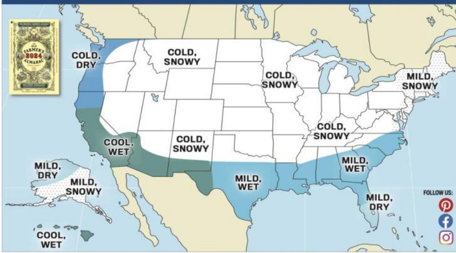
THIS ILLUSTRATION IS AVAILABLE TO DOWNLOAD FOR PUBLICATION AT ALMANAC.COM/MEDIA.